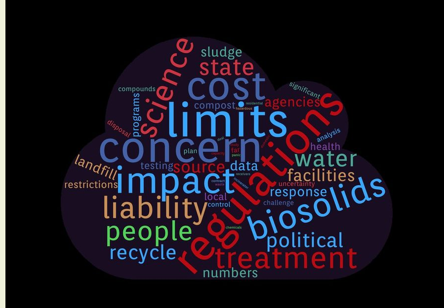
Most commonly used words when talking about PFAS concerns.